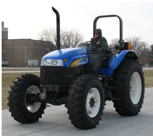
New Holland TS6030 Diesel

Institute of Agriculture and Natural Resources University of Nebraska-Lincoln