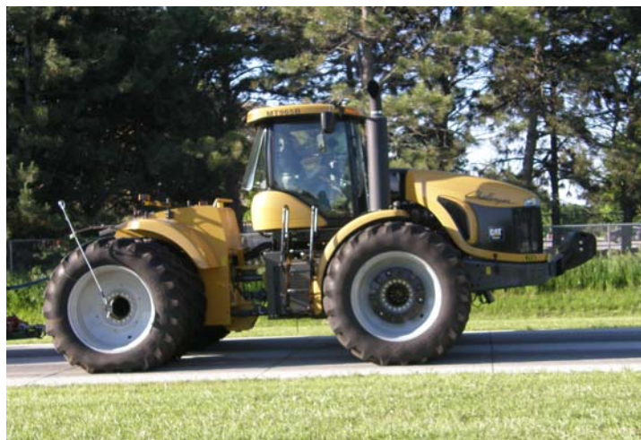
CHALLENGER MT965B DIESEL