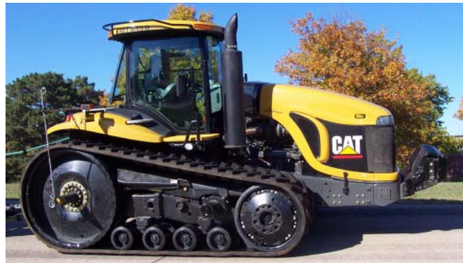
CHALLENGER MT845B DIESEL

Institute of Agriculture and Natural Resources University of Nebraska-Lincoln