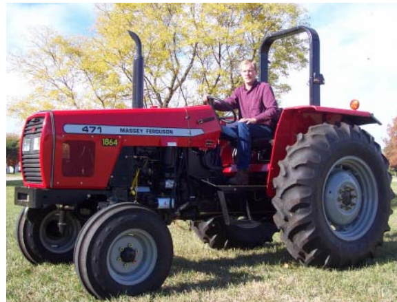
MASSEY FERGUSON 471 Diesel

Institute of Agriculture and Natural Resources University of Nebraska-Lincoln