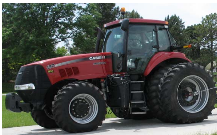
CASE IH MAGNUM 190 DIESEL