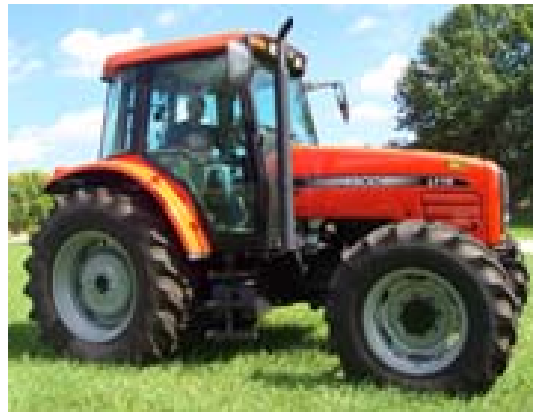
AGCO LT75A Diesel