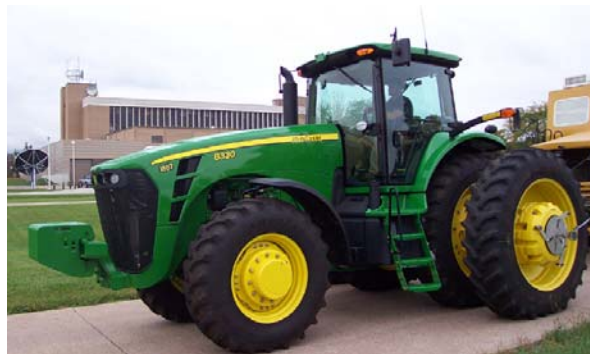
JOHN DEERE 8330 DIESEL

Institute of Agriculture and Natural Resources University of Nebraska-Lincoln