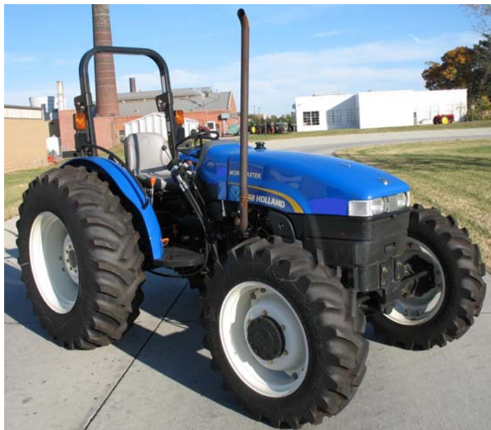
New Holland Workmaster 65 Diesel Institute of Agriculture and Natural Resources University of Nebraska-Lincoln