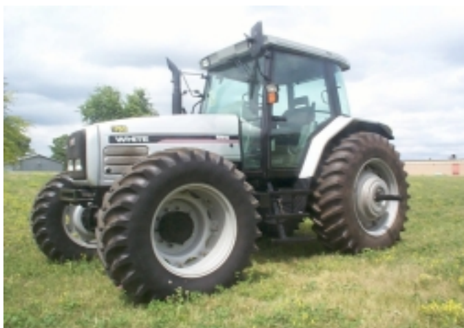
White 6810 Diesel