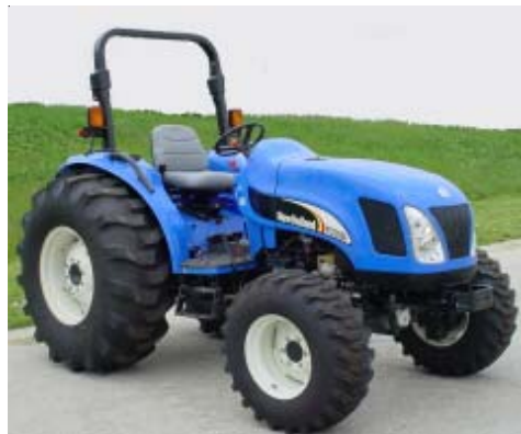
New Holland TC55DA Diesel

Institute of Agriculture and Natural Resources University of Nebraska-Lincoln