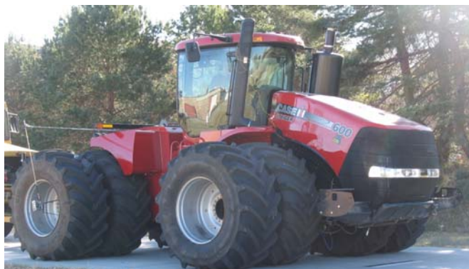
CASE IH STEIGER 600 Diesel

Institute of Agriculture and Natural Resources University of Nebraska-Lincoln