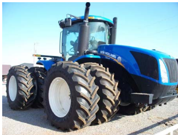
New Holland T9.505 Diesel

Institute of Agriculture and Natural Resources University of Nebraska-Lincoln