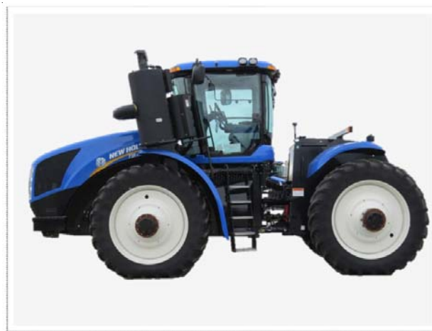
NEW HOLLAND T9.480 Diesel

Institute of Agriculture and Natural Resources University of Nebraska-Lincoln