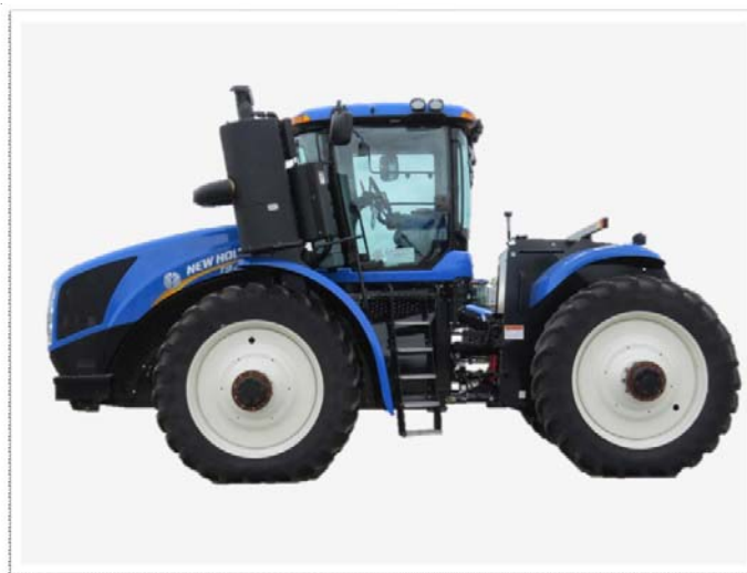
NEW HOLLAND T9.435 Diesel