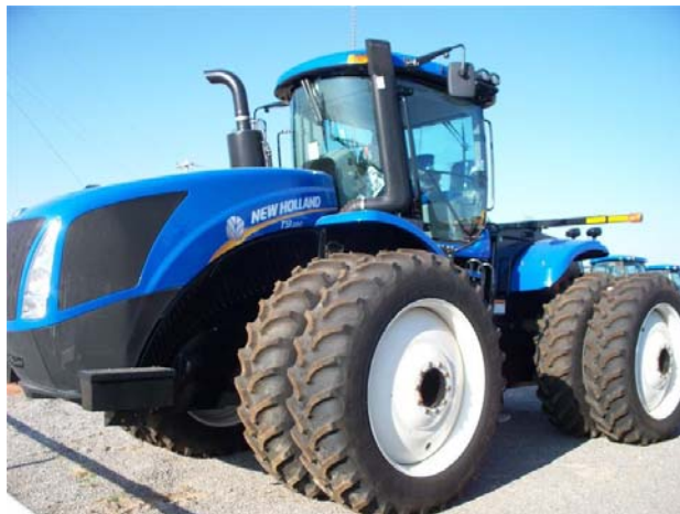
New Holland T9.390 Diesel

Institute of Agriculture and Natural Resources University of Nebraska-Lincoln