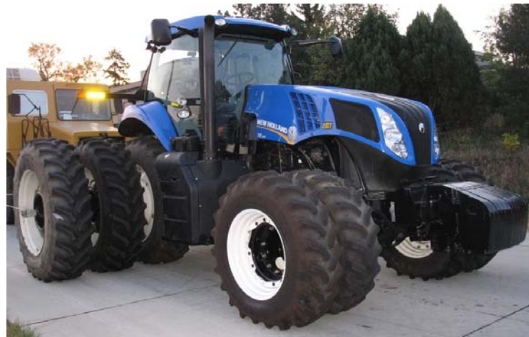
NEW HOLLAND T8.420 DIESEL