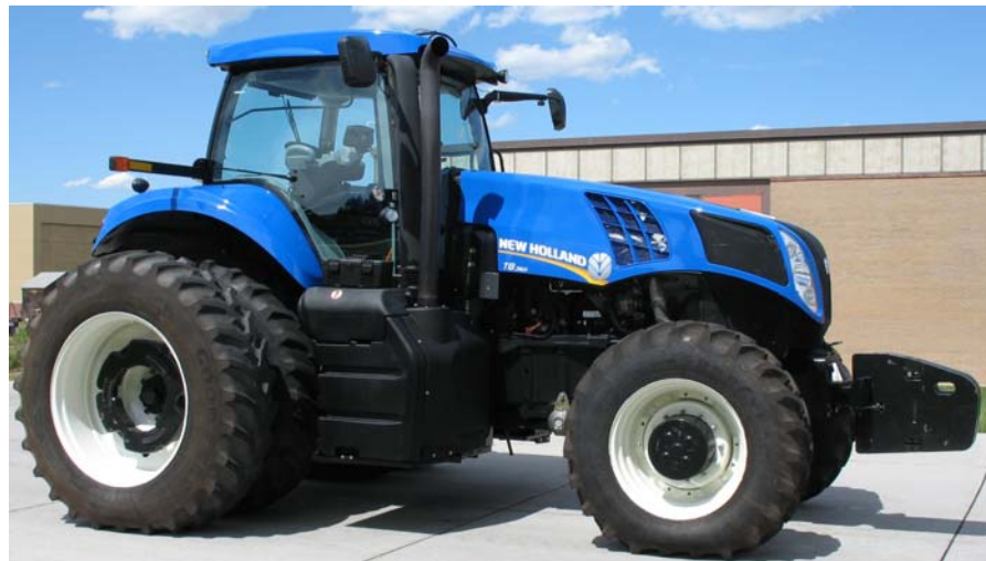
NEW HOLLAND T8.360 DIESEL