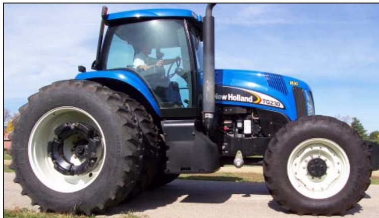
NEW HOLLAND TG230 DIESEL