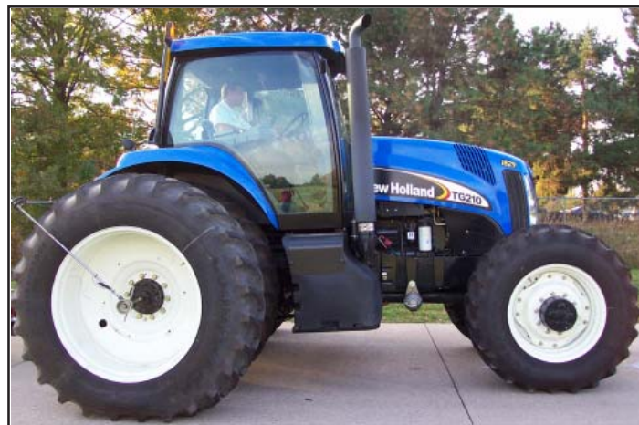
NEW HOLLAND TG210 DIESEL