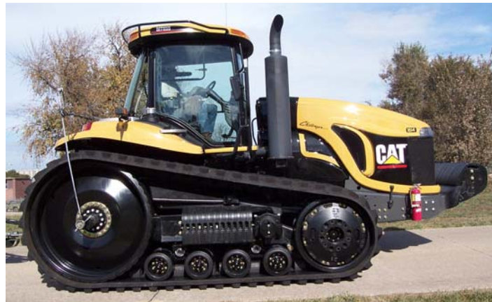
CHALLENGER MT855 DIESEL