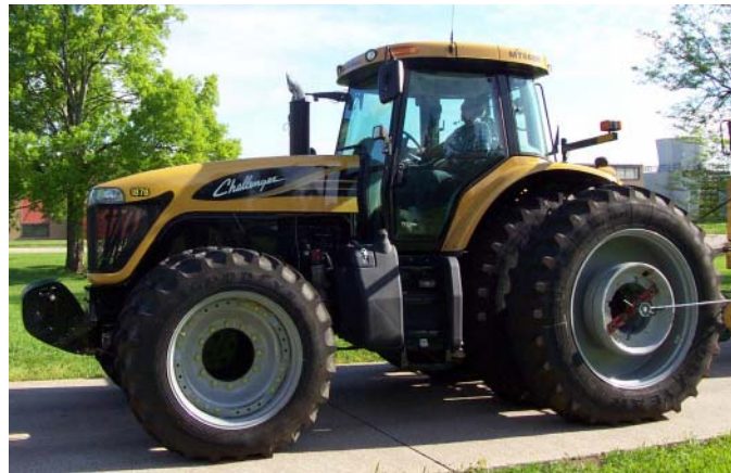
Challenger MT 665B Diesel