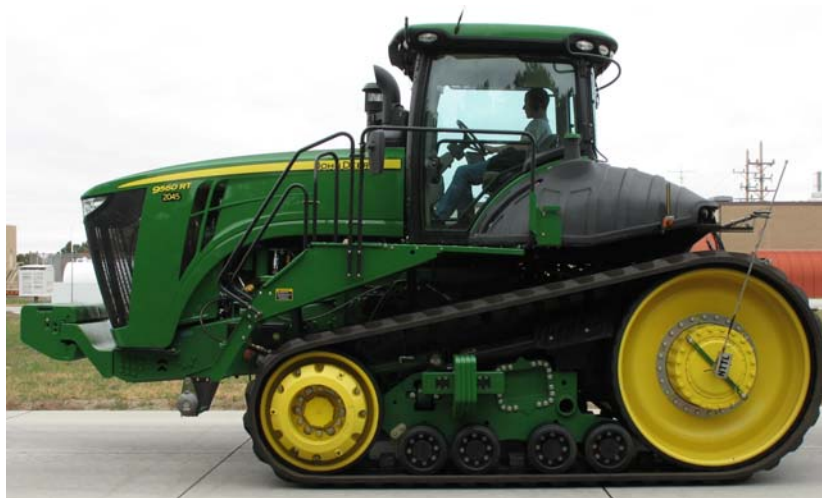
JOHN DEERE 9560RT DIESEL

Institute of Agriculture and Natural Resources University of Nebraska–Lincoln