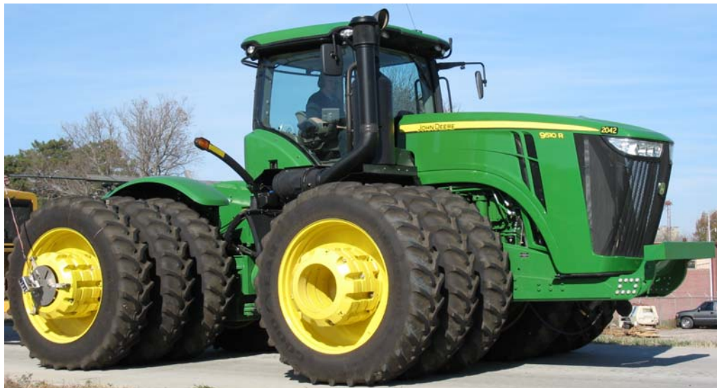
JOHN DEERE 9510R DIESEL