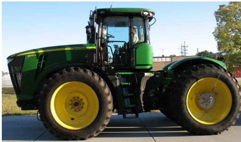
JOHN DEERE 9410R DIESEL