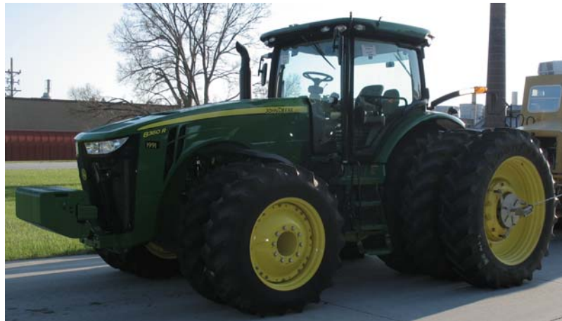
JOHN DEERE 8360R DIESEL