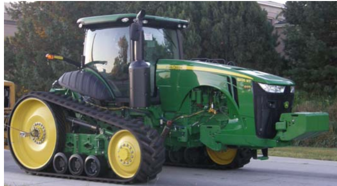
JOHN DEERE 8335RT DIESEL