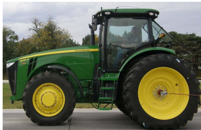
JOHN DEERE 8235R DIESEL