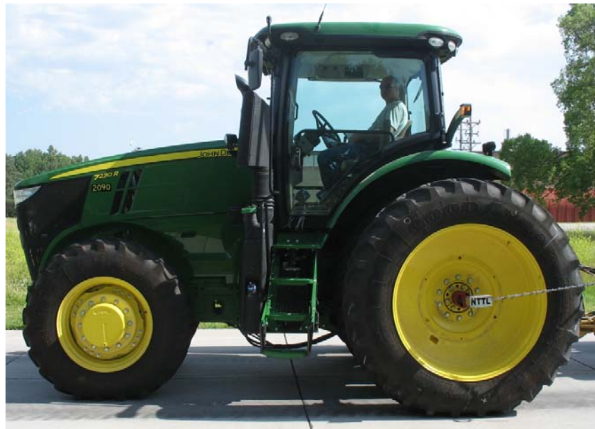
JOHN DEERE 7230R DIESEL

Institute of Agriculture and Natural Resources University of Nebraska—Lincoln