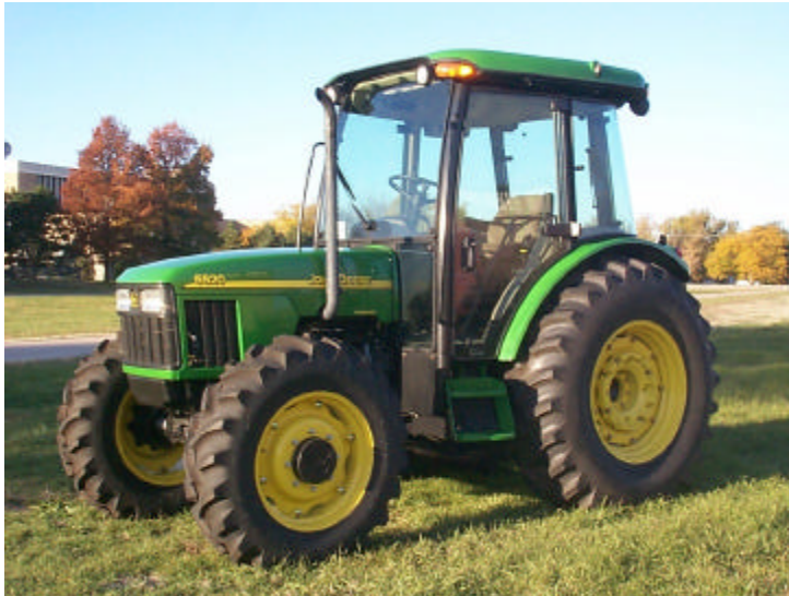
JOHN DEERE 5520 DIESEL