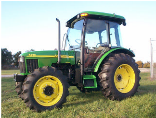
John Deere 5420 Diesel

Hitch point distance to ground level in. (mm) 8.0 (203) 15.0 (381) 22.0 (559) 29.0 (737) 36.0 (914) Lift force on frame lb 4694 4829 4685 4266 3596 " " " " " " (kN) (20.9) (21.5) (20.8) (19.0) (16.0)