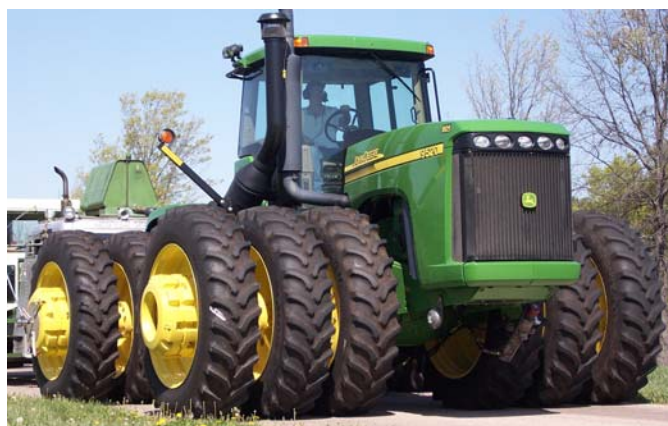
JOHN DEERE 9520 DIESEL