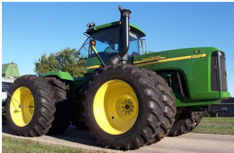
JOHN DEERE 9220 DIESEL