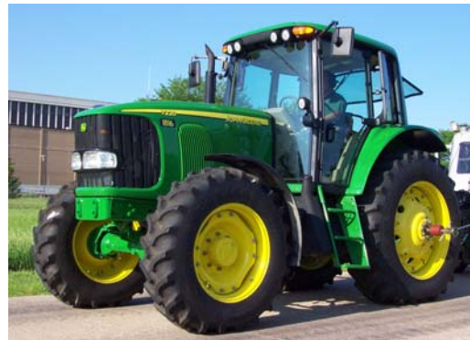
JOHN DEERE 7220 DIESEL