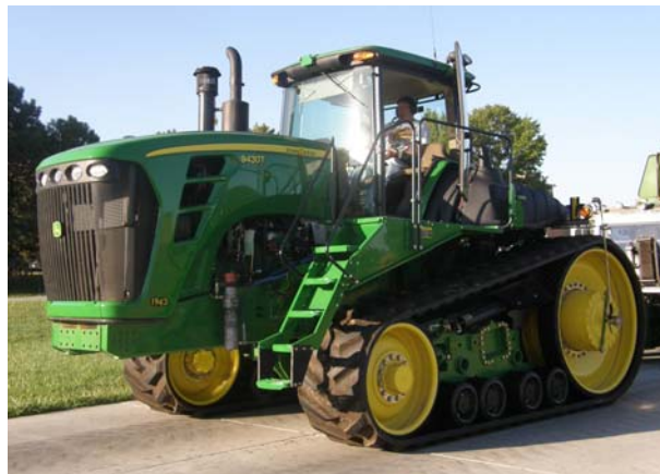
JOHN DEERE 9430T DIESEL