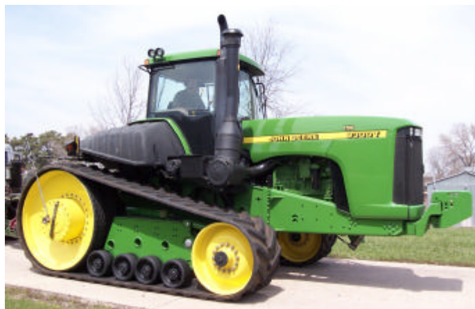
JOHN DEERE 9300T DIESEL