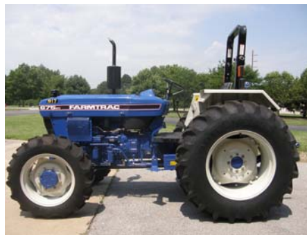
FARMTRAC 675 DTC Diesel

Institute of Agriculture and Natural Resources University of Nebraska-Lincoln