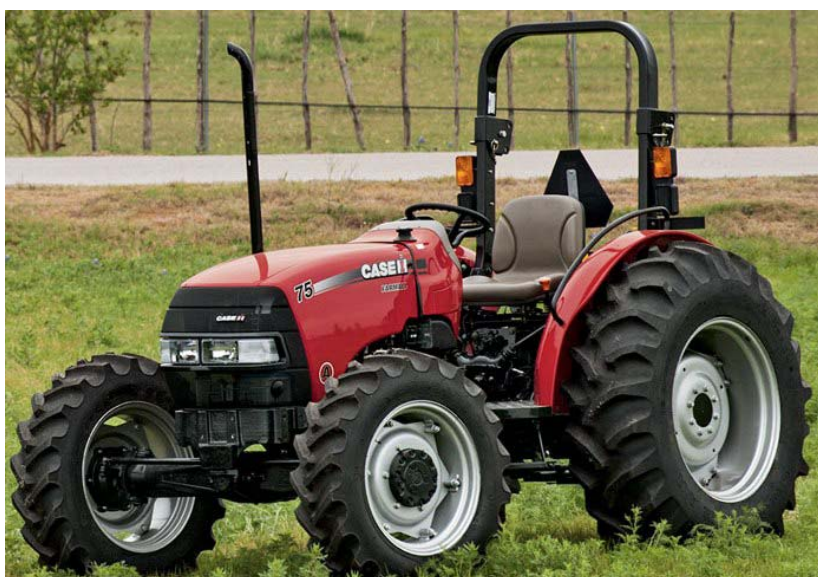
Case IH Farmall 75A Diesel Institute of Agriculture and Natural Resources University of Nebraska-Lincoln