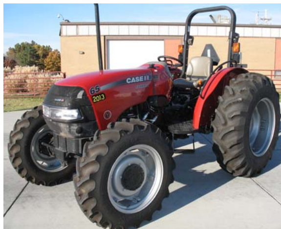
Case IH Farmall 65A Diesel Institute of Agriculture and Natural Resources University of Nebraska-Lincoln

REPAIRS AND ADJUSTMENTS: No repairs or adjustments.