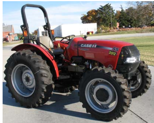
Case IH Farmall 55A Diesel