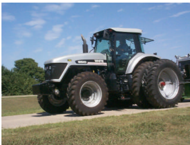
White 8510 Diesel