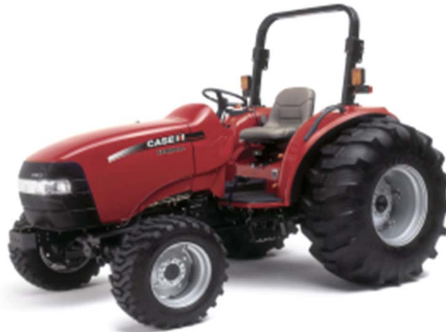
CASE IH Farmall 50 Diesel

Institute of Agriculture and Natural Resources University of Nebraska-Lincoln