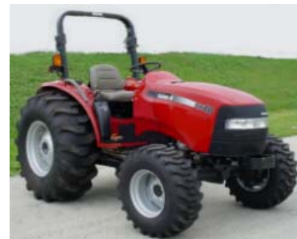
Case IH DX 48 Diesel