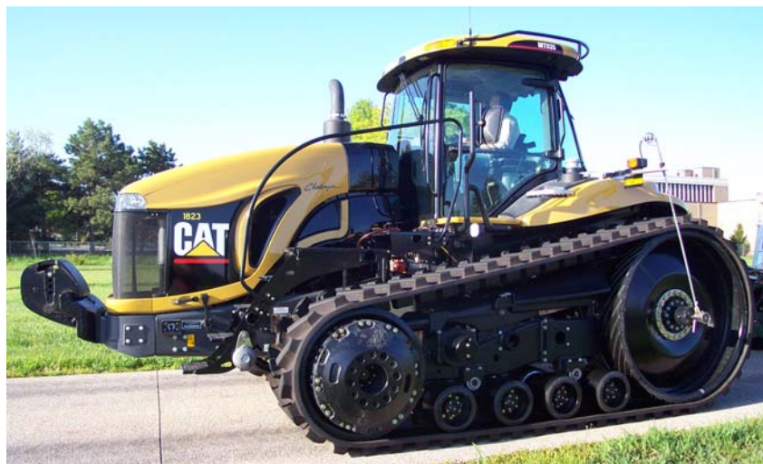
CHALLENGER MT835 DIESEL