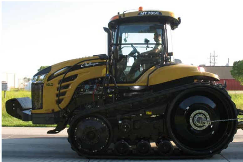
CHALLENGER MT765E DIESEL