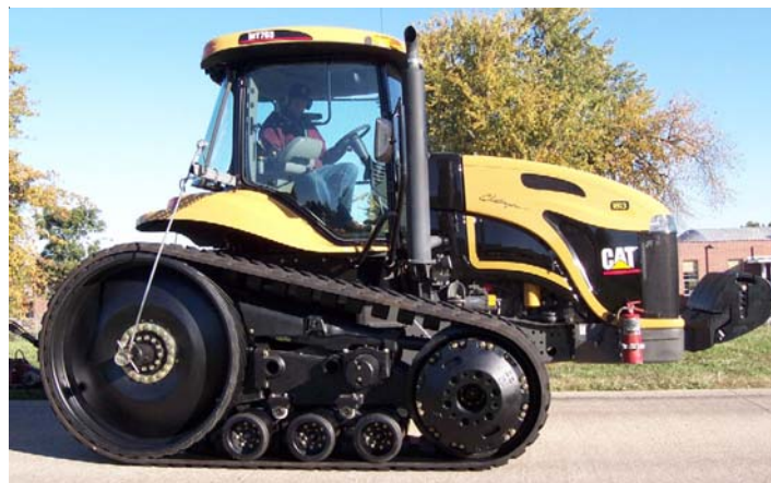
CHALLENGER MT765 DIESEL