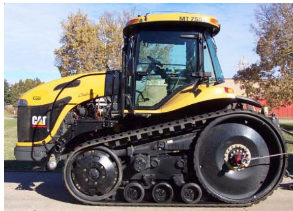
CHALLENGER MT755B DIESEL