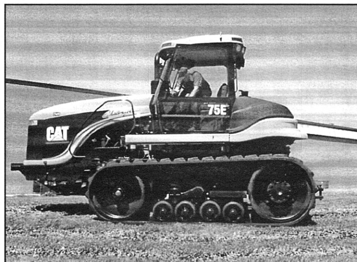
CATERPILLAR CHALLENGER 75E DIESEL