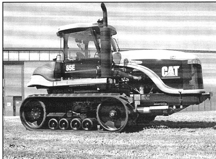
CATERPILLAR CHALLENGER 65E DIESEL