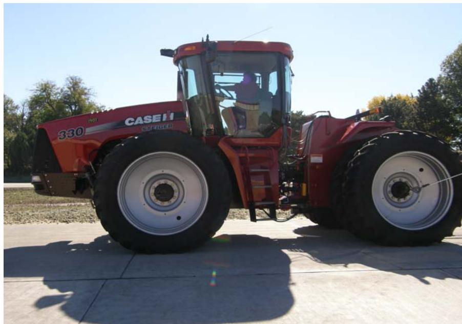
Case IH Steiger 330 Diesel