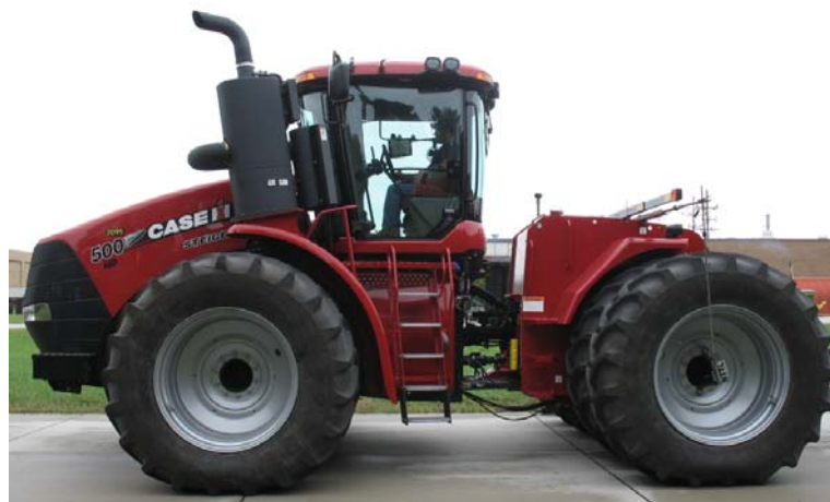
CASE IH STEIGER 500 Diesel